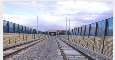
*Images serve as examples of noise mitigation measures and are not an indication of a preferred method for use on the California High-Speed Rail project