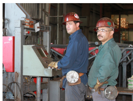
Martinez Steel employees overseeing work in their factory in Fontana.