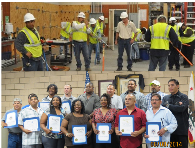
Recent graduates of the pre-apprenticeship program display their completion certificates.

In June 2014, 22 people completed the first six-week training session of the Building Trades Pre-Apprenticeship Training Program, with 11 of them becoming apprentices. The purpose of this training program is to prepare Valley job-seekers with qualifications to work on construction projects and possibly the high-speed rail program. The initial focus is on training operating engineers and laborers, who are in demand for rail construction, with a goal to ultimately train 325 workers. In total, the program will include 13 cohorts – both for pre-apprenticeship and journeyman upgrade – and involve seven trade affiliates. The program is funded with a $1.5 million state grant awarded to workforce investment boards in Fresno, Stanislaus, Kern, Inyo and Mono counties.