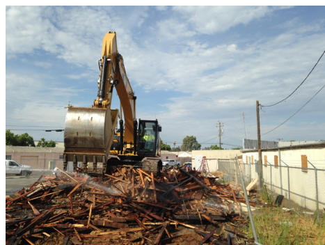
J. Kroeker, Inc. demolishing the Hollywood Inn in downtown Fresno on July 14.